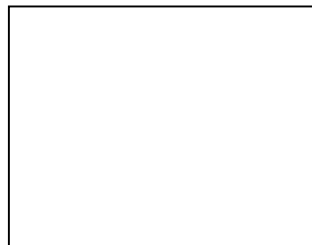
Stamp of Contact Person

_____ Signature of CONFOREST Contact Person (Insert name here)